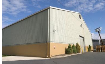
Rear Bldg. 3, 44,574 SF, Clear Span