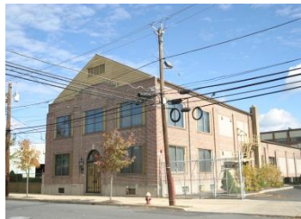
Two Story Office, 13,565 SF