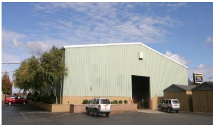
Rear Bldg. 1, 12,200 SF, Clear Span