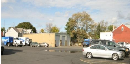
Repair Facility, Bldg. 4