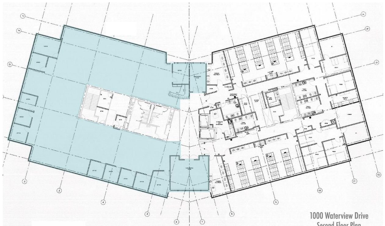
1000 Waterview Drive Second Floor Plan