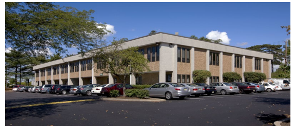
451-475 Wall Street Building A

1 st Floor: 4,198 SF 2 nd Floor: 4,107 SF