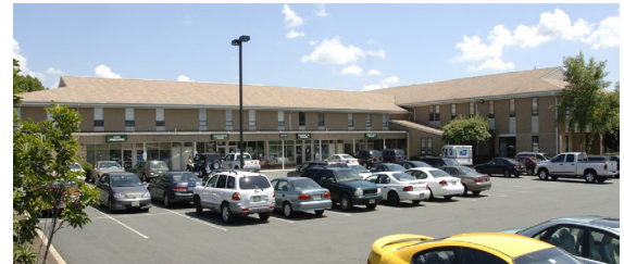
401-450 Wall Street Building B

1 st Floor: 4,198 SF 2 nd Floor: 4,107 SF